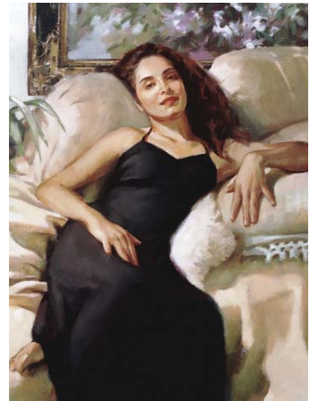
A beautiful portrait is a creation that both painter and subject can take pride in. This example by Don Mullins clearly demonstrates this principle.

Ideally, subsequent sittings are scheduled to develop and complete the painting. If schedules don't permit, the painting may be largely painted in the studio with details polished in a final sitting.