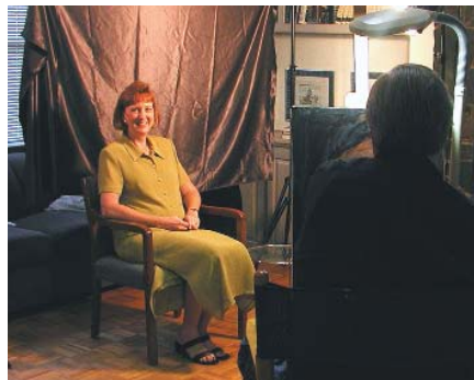
Sitting for a portrait painter is a relaxed, pleasant and enjoyable experience.

A fine portrait takes time to create. Both painter and subject require time commitments. Superior portraits are painted from life sittings. Generally, the more sittings the better. A minimum of two or three sittings is essential; an initial sitting is necessary to study possible poses and gestures, make sketch notes and shoot reference photography to be used only as general reference for certain details like clothing.